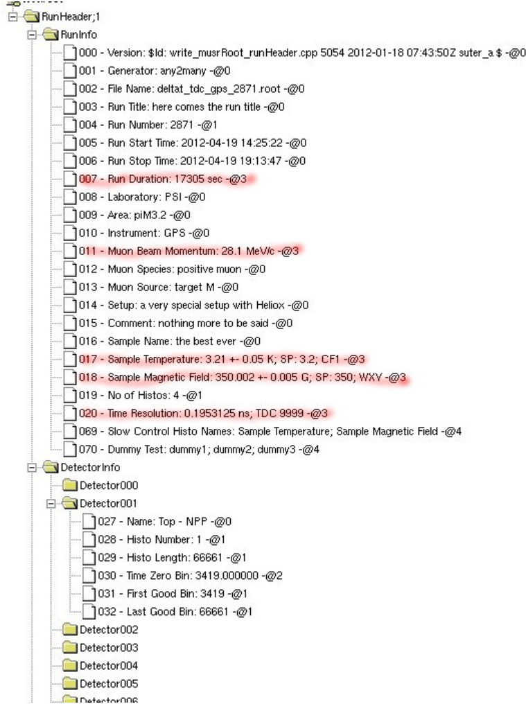
Figure 1: TMusrRunHeader mock up. The red shaded entries are of type TMusrRunPhysicalQuantity .

A mock-up TBrowser print-out would look like the one shown in Fig. 1. You might notice, that at the end of each entry you find a “-@X”, where “X” is a number. This is an encoding of the internal type of the entry and is the price to be paid not using derived types. The next section will explain this in much more detail.